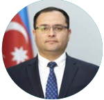
Majnun Mammadov Minister, Ministry of Agriculture of the Republic, Azerbaijan