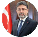
İbrahim Yumaklı Minister, Ministry of Agriculture and Forestry, Türkiye